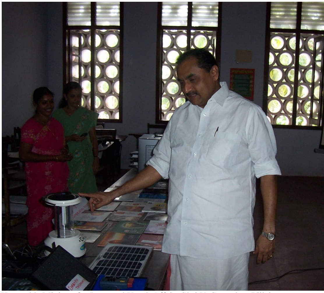
Honorable Minister for Ports and Youth Affairs Shri V. Surendran Pillai

Around 2000 students and teachers visited the stall and they responded well with their doubts/queries related to various electronic and household gadgets. They seem biased to reading the journals/posters/magazines displayed rather than learning by practice on the kits provided (e.g. b1, b2). Besides demonstration of various energy saving utilities on colleges, deployment of sample in their labs might enlighten/sustain our motto "Conserve Energy to Consume for Ever"